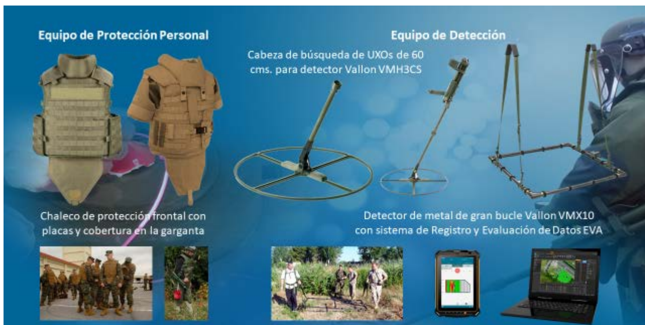
Figure 2. EOD protective equipment for cluster munitions Contaminated Area cleanup.